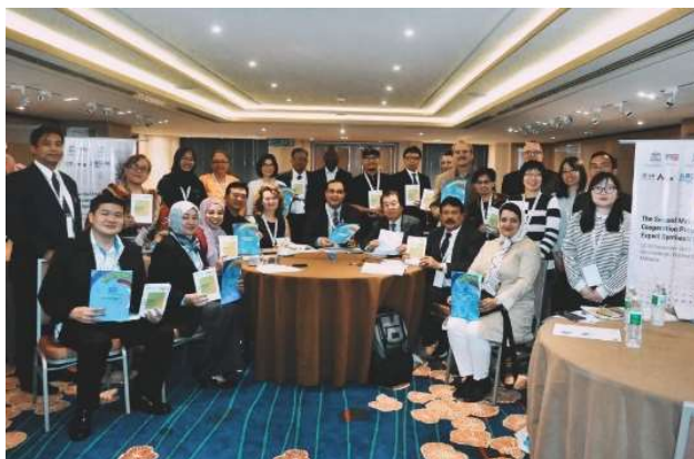
The second Malaysia-UNESCO Cooperation Program (MUCP) expert synthesis meeting