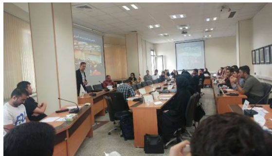
TA training workshop, October 2019