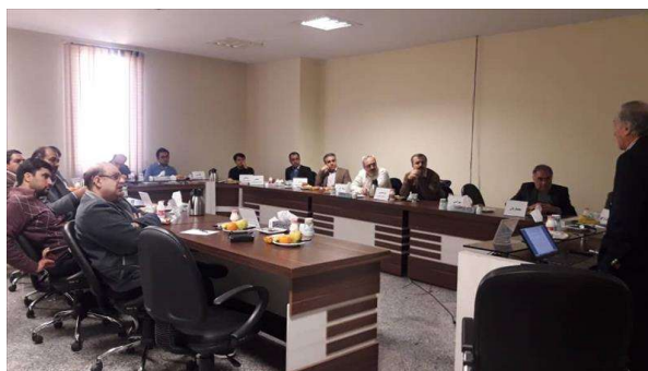
The workshop on “Mechanism of internal assessment of engineering education programs”, December 2019

At the end of each workshop/course, a certificate was granted to the participants.