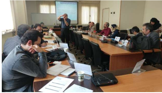
Four days faculty development educational course, September 2019