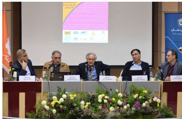
The round meeting held in the 6 th International Conference on Engineering Education