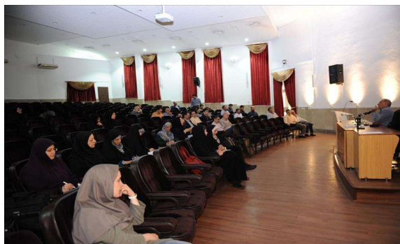
The workshop on “Program Accreditation, based on ABET standards”, 10 July 2019