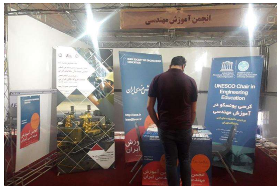
27 th Annual International Conference of the Iranian Society of Mechanical Engineers, April 2019