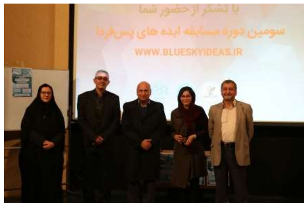
Third competition of Post-Tomorrow Ideas in Civil Engineering ?? & December, 2019