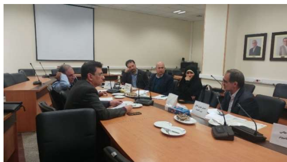
A workshop on “How to develop and present a workshop for TA training”, April 2019