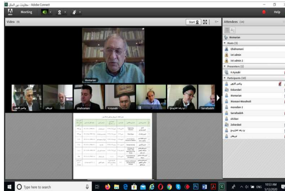
The joint meeting of UNESCO Chairs of the University of Tehran, May 2020.